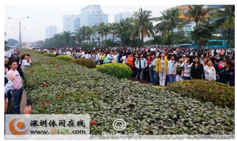
Nearly 1,000 workers from Shenzhen's Hailiang Storage Products firm block a downtown thoroughfare, 19 December 2007

public protest in the hope of forcing the government to intervene on their behalf. At least nine of the cases in this report were triggered by arbitrary management changes to wage structures and pay rates, workloads and working hours.