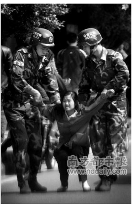
Riot police remove a female worker at a street demonstration during a strike on 6-7 March 2008 by several thousand workers at Casio Electronics, Guangzhou. Photo <u>Southern Metropolis Daily</u>.

The Chinese government has a well-thumbed playbook for dealing with "mass incidents," based on the 2007 Emergency Response Law , Article 52 of which requires local police and security forces to restore order as quickly as possible after a mass incident that "severely jeopardises public order." An analysis of the 100 cases in this report shows that the measures taken by local government nationwide to deal with workers' collective protests were basically in line with the central government's emergency response measures and legislation. After a strike breaks out, the local government sends in the police to seal off the main factory entrance and prevent workers from getting on to the streets, staging demonstrations or blocking roads, railway lines or bridges. When a blockade does occur, riot police may be called in to persuade participants to abandon the action and allow resumption of traffic. Should the protesters refuse to comply, police may forcibly disperse them.